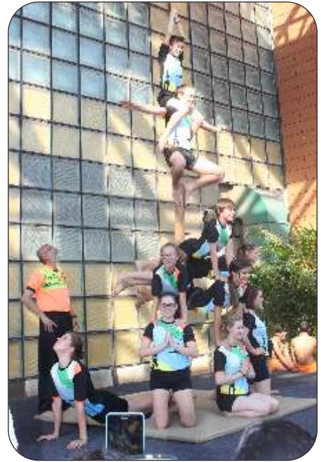
Shree Samartha Vyayam Mandir, Dadar