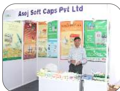
Asoj Soft Caps Pvt. Ltd