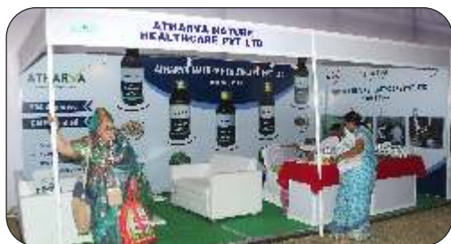
Atharva Nature HealthCare Pvt. Ltd