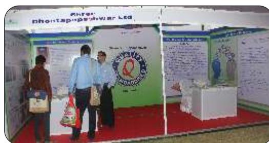
Shree Dhootapapeshwar Ltd