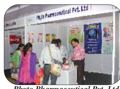
Phyto Pharmaceutical Pvt. Ltd