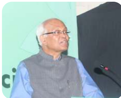
Dr. R. A. Mashelkar