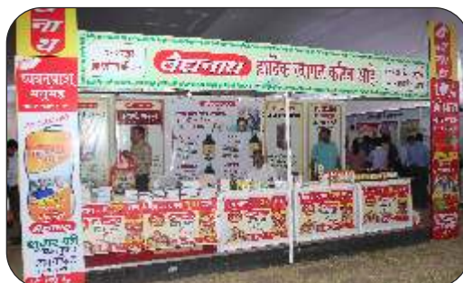
Shree Baidyanath Ayurved Bhavan Ltd