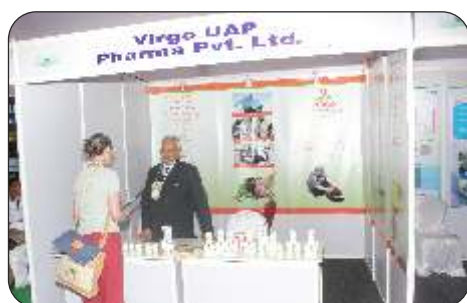
Virgo UAP Pharma Pvt. Ltd