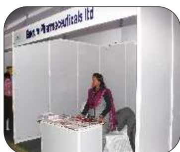
Emcure Pharmaceuticals Ltd.